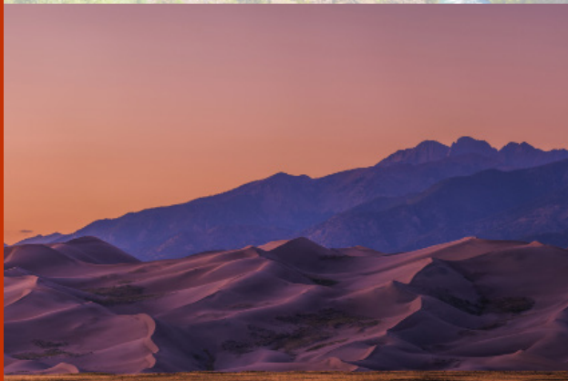
Great Sand Dunes National Park Alamosa, CO