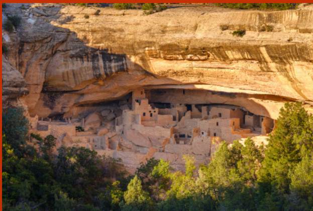
Mesa Verde National Park Mesa Verde, CO