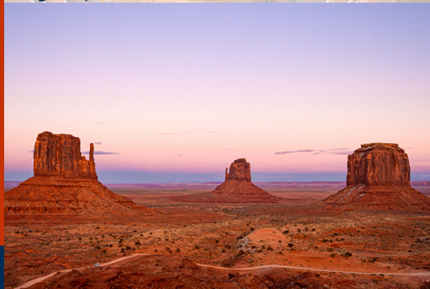
Monument Valley, AZ