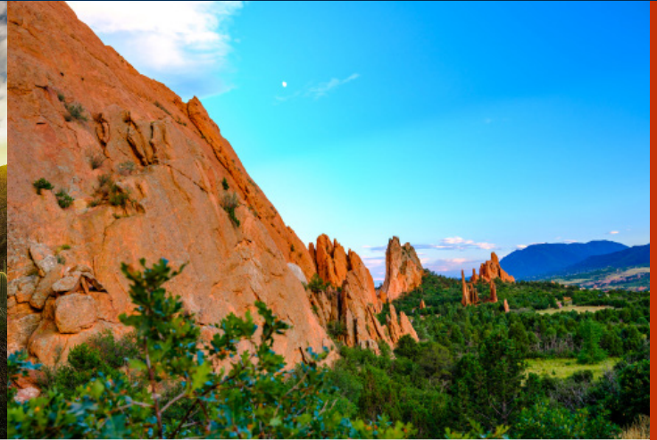
Garden of the Gods - Colorado Springs, CO