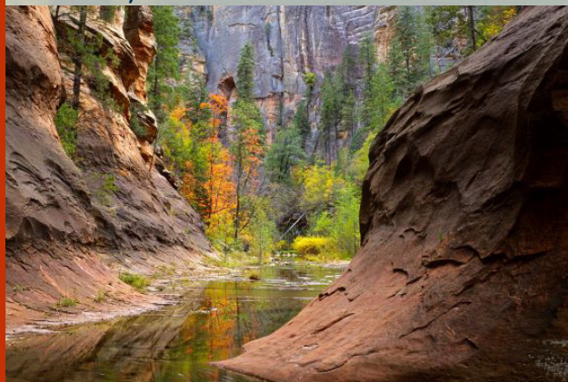
West Fork at Oak Creek Sedona, AZ