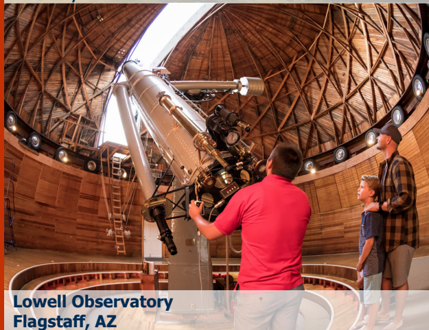
Lowell Observatory Flagstaff, AZ