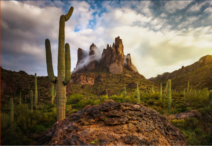
Superstition Mountains - Phoenix, AZ