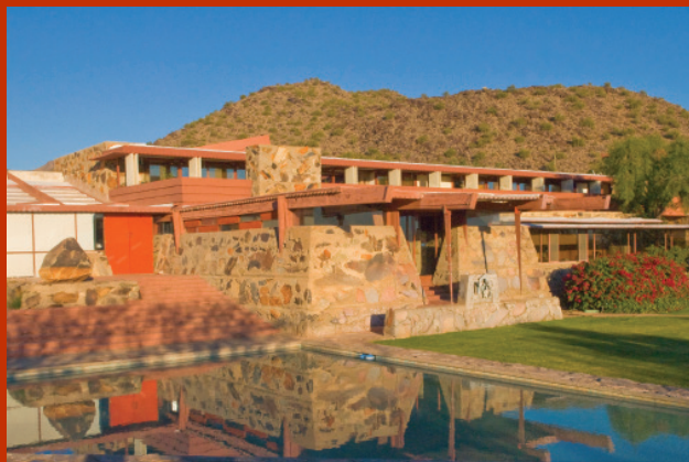
Frank Lloyd Wright's Taliesin West Scottsdale, AZ